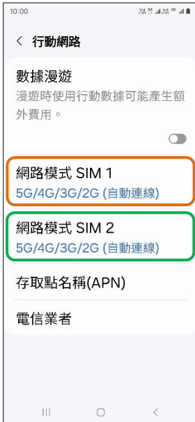
4.網路模式 SIM1/SIM2 (例: SIM1)