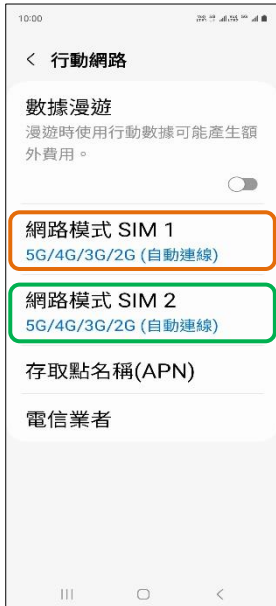
4.網路模式 SIM1/SIM2 (例: SIM1)