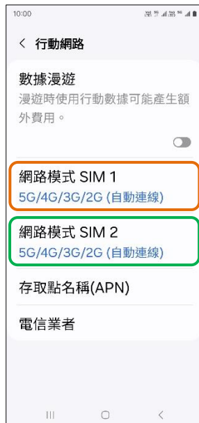
4.網路模式 SIM1/SIM2 (例: SIM1)