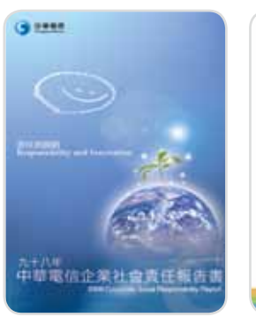
Chunghwa Telecom CSR Report 2009 Published in August, 2010