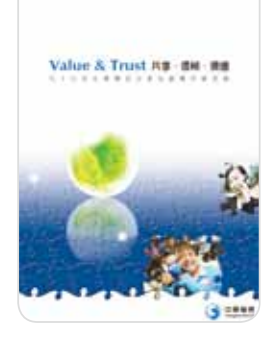
Chunghwa Telecom CSR Report 2008 Published in September, 2009