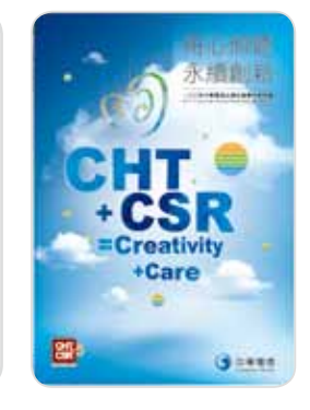
Chunghwa Telecom CSR Report 2011 Published in August, 2012