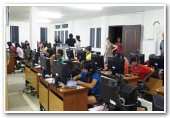
Continued focus on disadvantaged children in remote areas, inspiring them to better their lives.

College students involved in this remote tutoring program come to treat school children in remote communities in exactly the same way as their own brothers and sisters after long time tutoring and learning.