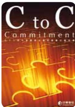
Chunghwa Telecom CSR Report 2007 Published in May, 2008