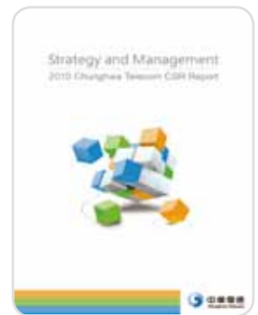
Chunghwa Telecom CSR Report 2010 Published in February, 2012