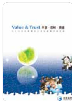
Chunghwa Telecom CSR Report 2008 Published in September, 2009