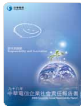
Chunghwa Telecom CSR Report 2009 Published in August, 2010